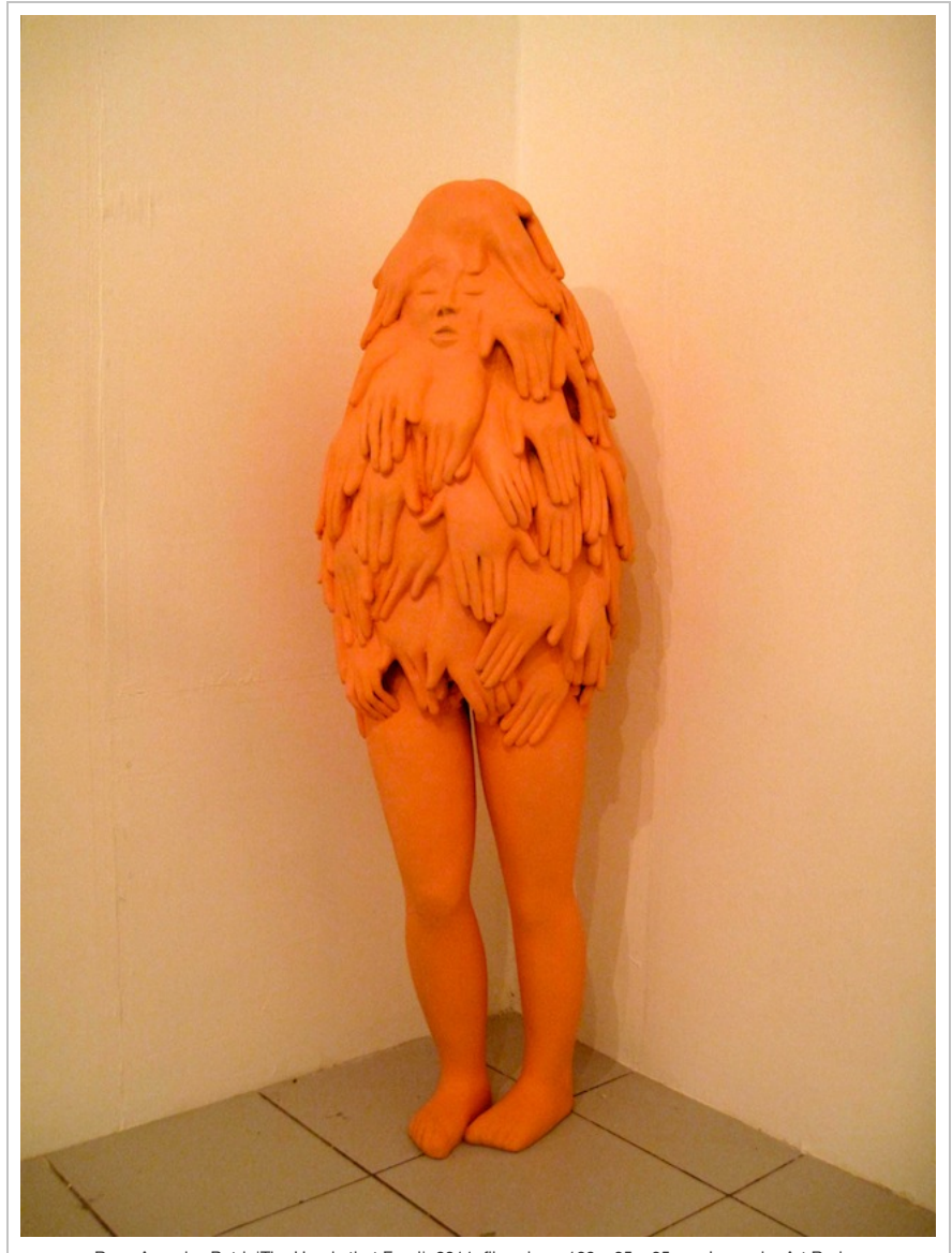
Rega Ayundya Putri, 'The Hands that Feed', 2011, fiberglass, 120 x 35 x 35 cm.