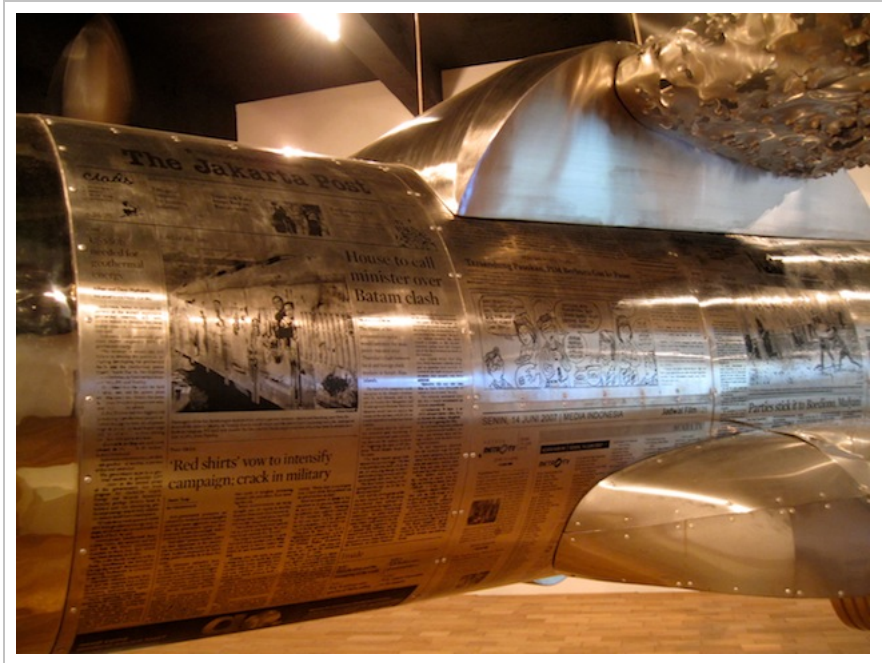
Pintor Sirait, 'Mythic Airways', 2011, stainless steel, variable dimensions.

At this year's Art Jog, prices of the works range from IDR3 million (USD320) to IRD2.5 billion (USD260,000). The latter is the price tag for Pintor Sirait 's Mythic Airways , a suspended stainless steel aircraft imprinted with pages from the English-language Indonesian newspaper, The Jakarta Post .