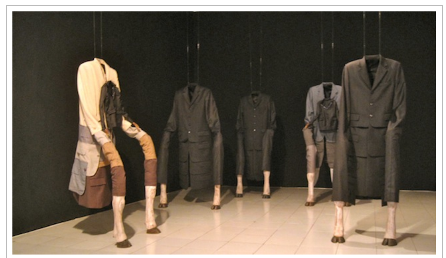
Mella Jaarsma, 'Animals Have No Religion / Indra I', 2012, costumes, wood, deer feet, variable dimensions.