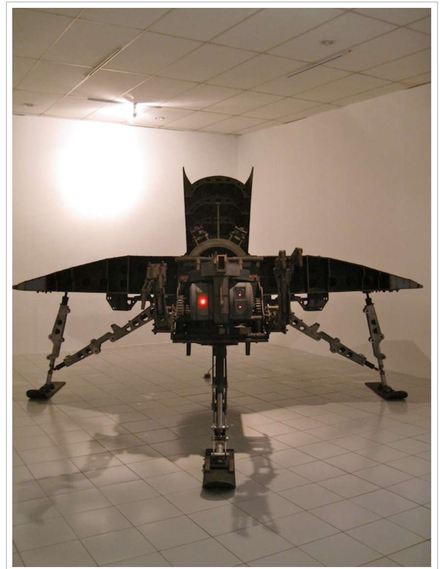
Yudi Sulistyo, 'Myiagros Army', 2012, paper, iron pipe, pvc pipe, wood, found object, paint, 400 x 500 cm.