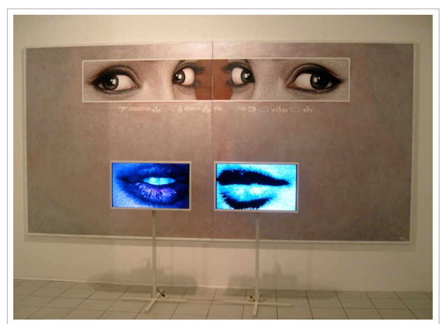
Galam Zulkifli, 'Seri Pencitraan #2: Lips -- Know Your Rights', 2012, acrylic on canvas and video, 200 x 400 cm (dyptich).