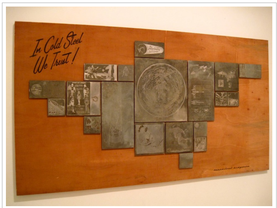
Nurrachmat Widyasena, 'In Cold Steel We Trust', 2011, etching on aluminium, 120 x 220 cm.

In response to the large presence of Yogyakarta artists at the fair, 79 works in total, Rakanteseta said, "Yogyakarta is where young artists in Indonesia come to study and work and try out new ideas."