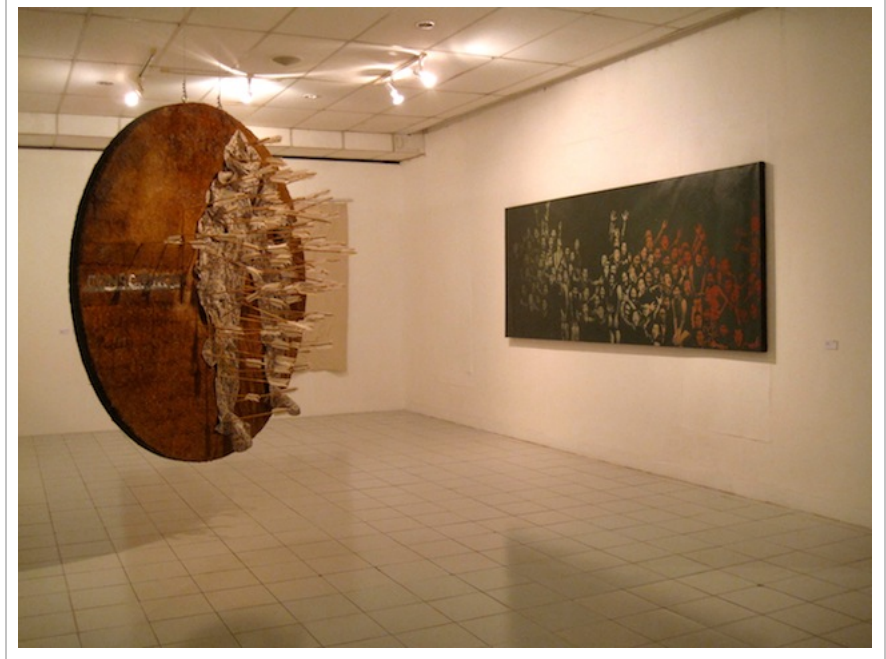
Left: Yuli Prayitno, 'Conscience', 2012, rubber, wood, fabric, metal, straw, 220 x 60 cm. Right: Filippo Sciascia, 'Lumina Keramaian', 2012, oil on canvas, 125 x 300 cm.