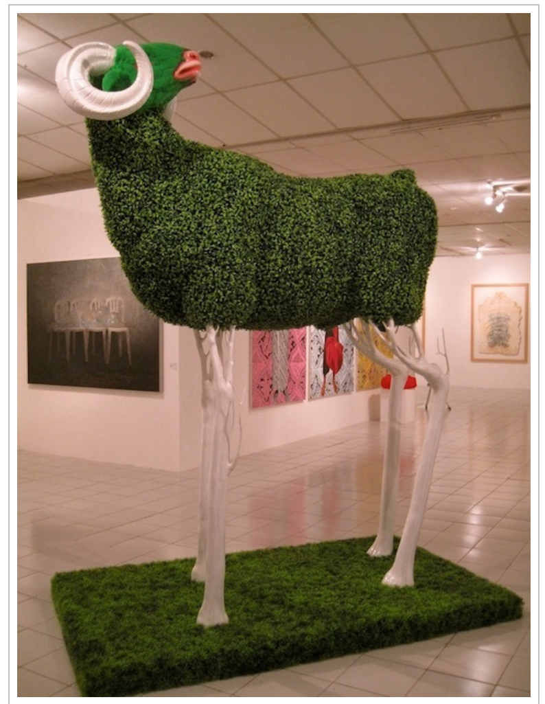
Dadi Setiadi, 'Green Dali', 2012, fiberglass, plastic grass, air brush, 200 x 280 x 90 cm.